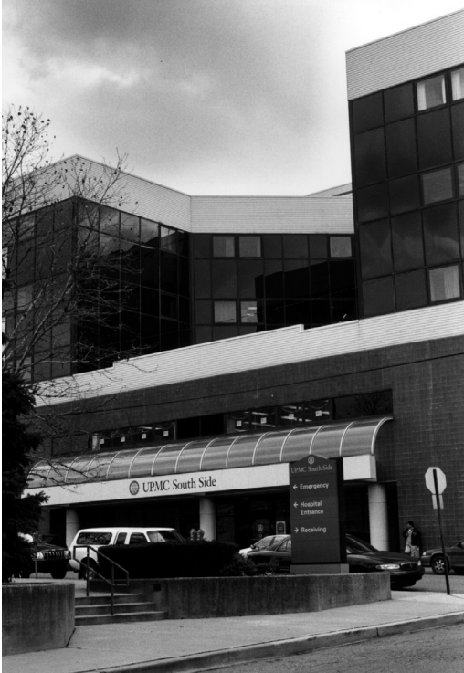
UPMC South Side, as it looks today.

Today, UPMC South Side , located at 2000 Mary Street, is a community hospital. It serves the South Side Flats and Slopes, Wards 29, 30 and 32 of the City of Pittsburgh, and the boroughs of Mt. Oliver, Brentwood, Whitehall, and Baldwin. The hospital employs about 600 people. About 300 of those employees live in areas served by the hospital! St. Joseph's Hospital was established in 1902 by the Sisters of St. Joseph. It was located in an old homestead in the 2000 block of East Carson Street. John T. Comes, an architect who is best known for his designs for Pittsburgh area churches, was hired to design a new six-story hospital building. It opened in 1907. St. Joseph's Hospital remained in operation on the South Side for 75 years. The building now has a new name and a new mission. It is Carson Towers, an assisted living facility for older adults — most of whom are long-time South Side residents!