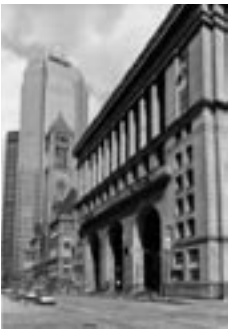
Grant Street, with One Mellon Bank Center, H.H. Richardson's Courthouse, and the City-County Building. The Mayor's office and Council Chambers are on the fifth floor of the City-County Building.

Department of City Planning 200 Ross Street Pittsburgh, PA 15219 (412) 255-8996 www.city.pittsburgh.pa.us/city_clerk