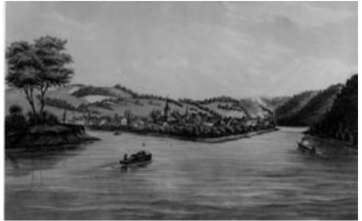
Pittsburgh in 1817