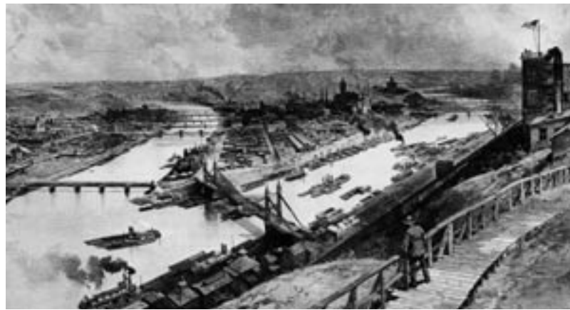
Pittsburgh c. 1890