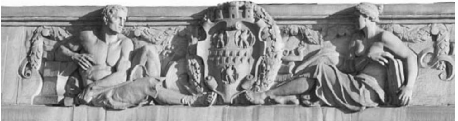
A detail from the City-County Building.