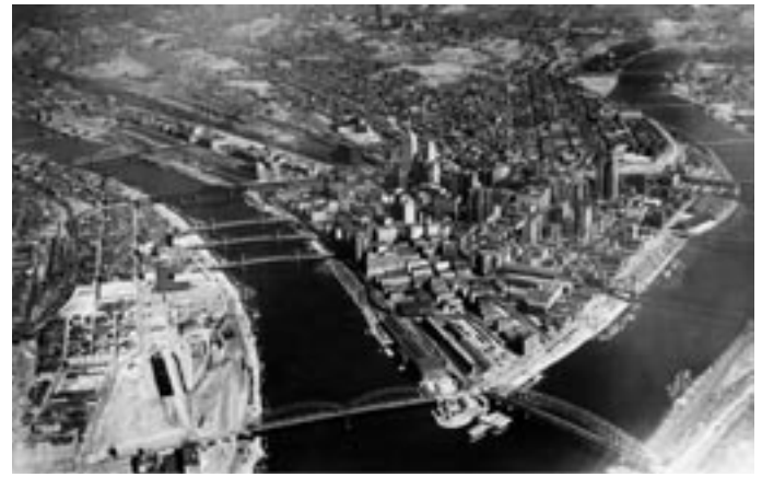
Pittsburgh c. 1940