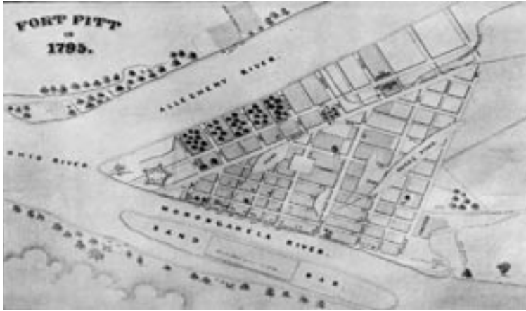
The Woods-Vickroy plan of 1784